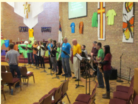
Adult Mission Praise Team