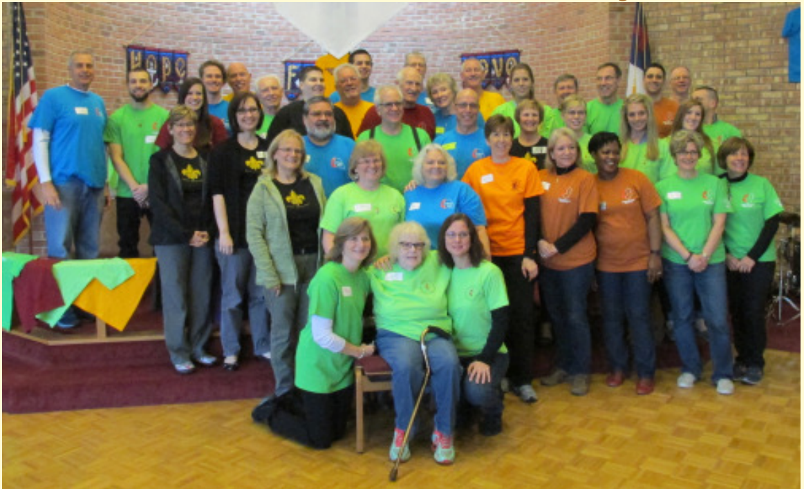
Some of the 74 people who have gone on Adult Mission trips