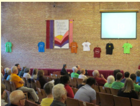
Mary's Message "What's With The T-Shirts?"