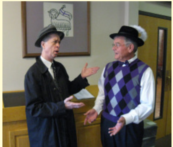
Jimmy Stewardship and Clarence

With God, all things are possible. When He calls us, we often think He is making a mistake. But God is not mistaken, He knows what he can do through us if we answer His call. Moses didn't think he was worthy to lead the slaves out of Egypt. George Bailey did not think managing a small bank was a very prestigious or worthy career. Both men accomplished a greater good for their community by answering God's call. How about you? Could God be calling you?