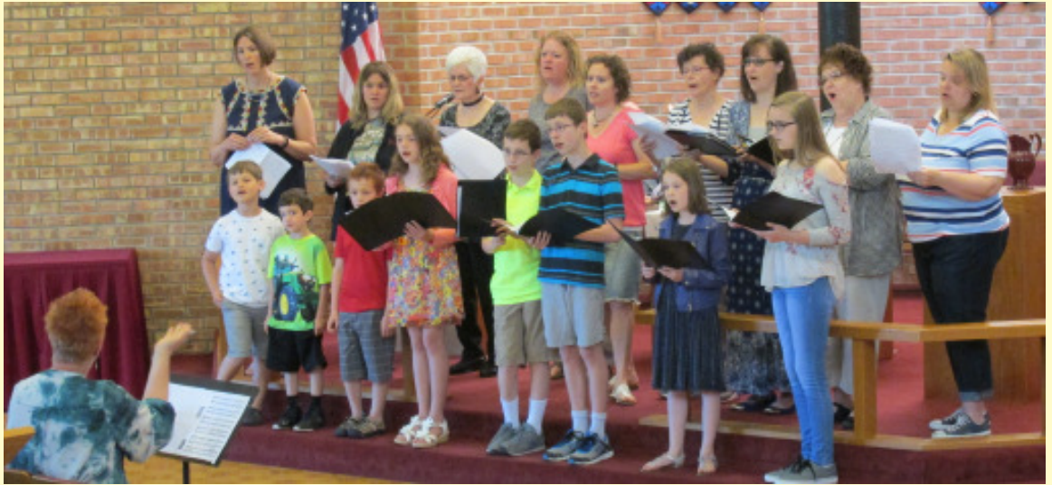
Mother's Day featured special music from kids, moms and grandmas