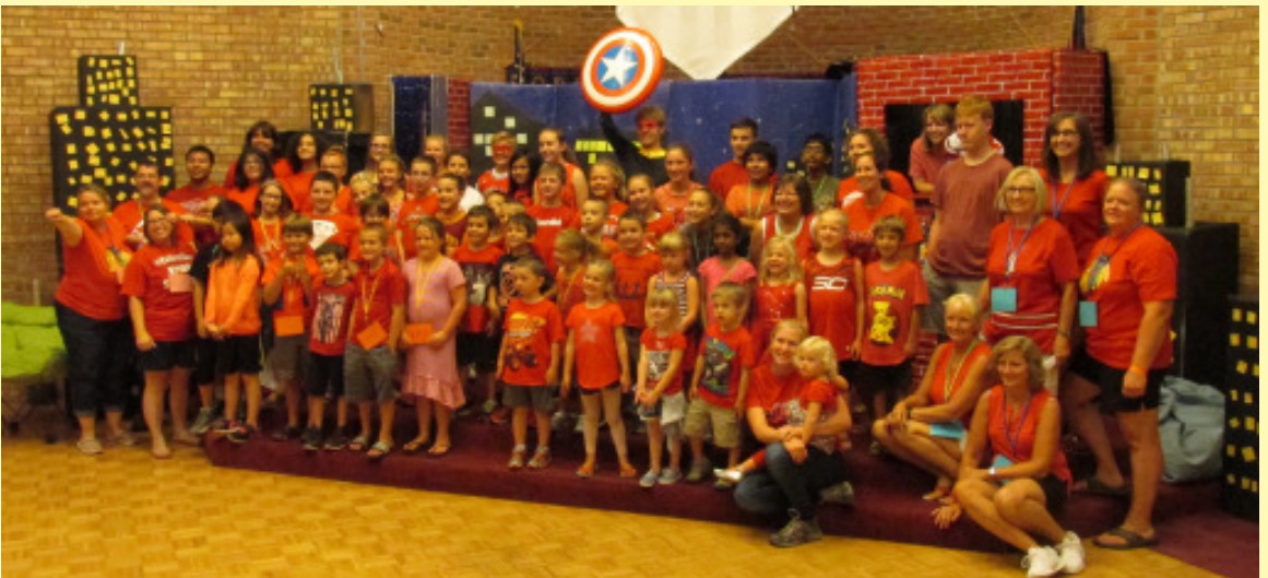
Vacation Bible School July 2017