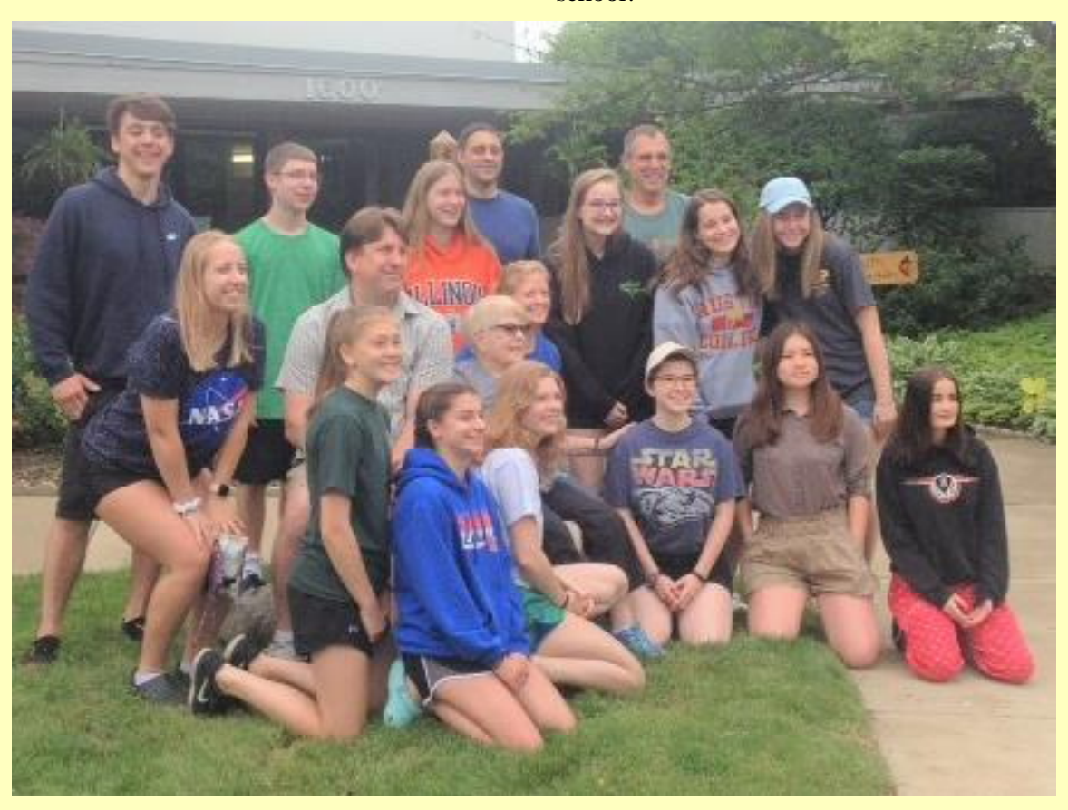
ASP Departure - June 15

. Rally Day is September 8ócan¢t wait to see everyone for the first day of Sunday school!