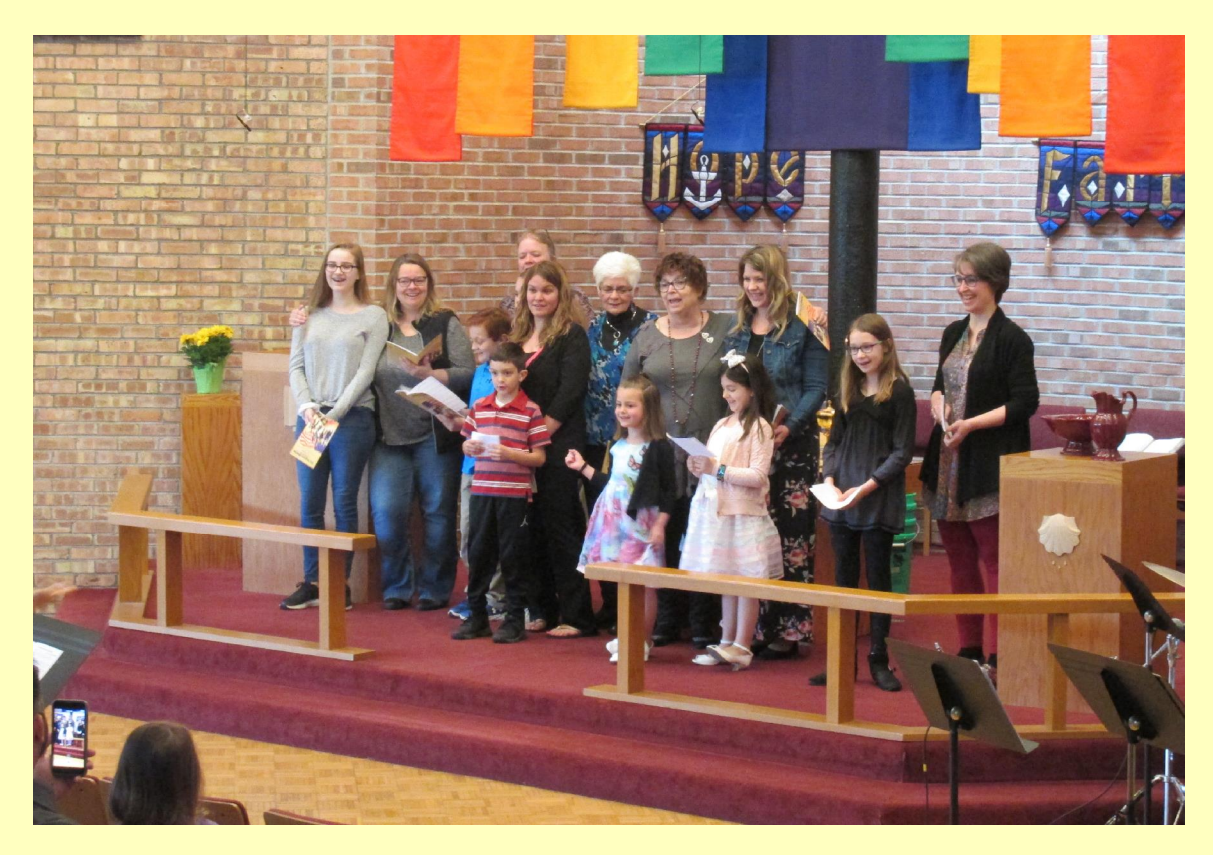
Mother's Day Music

Keep your eyes and ears open for announcements about ways that you can give your gifts, time and talents to these all-church projects to take care of our wonderful church we all love so much.