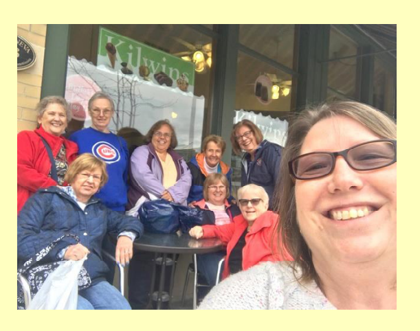
UMW Retreat - May 3-4